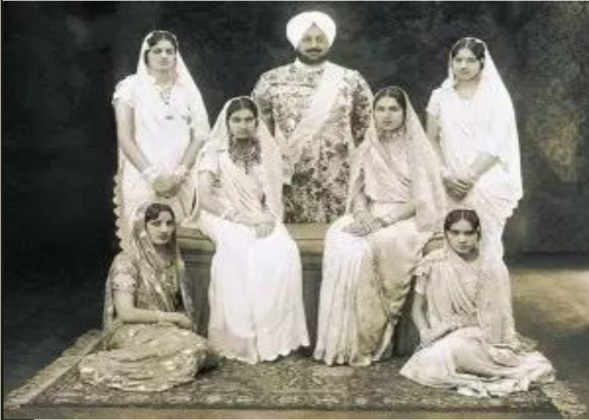
Practice of Polygamy