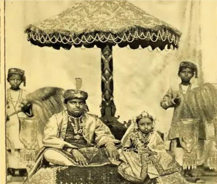
Practice of Child marriage