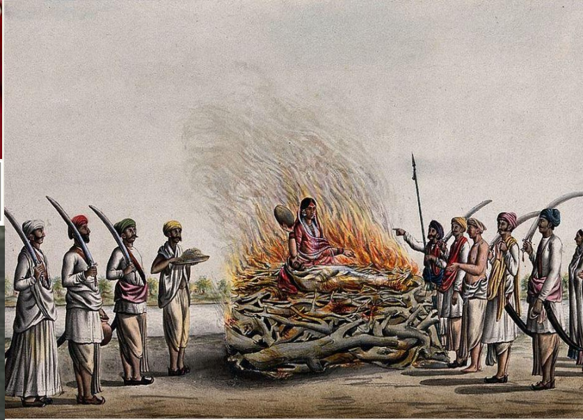
Practice of Sati