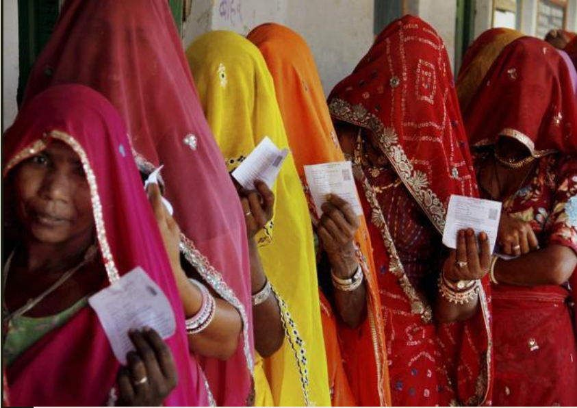
Practice of Purdah