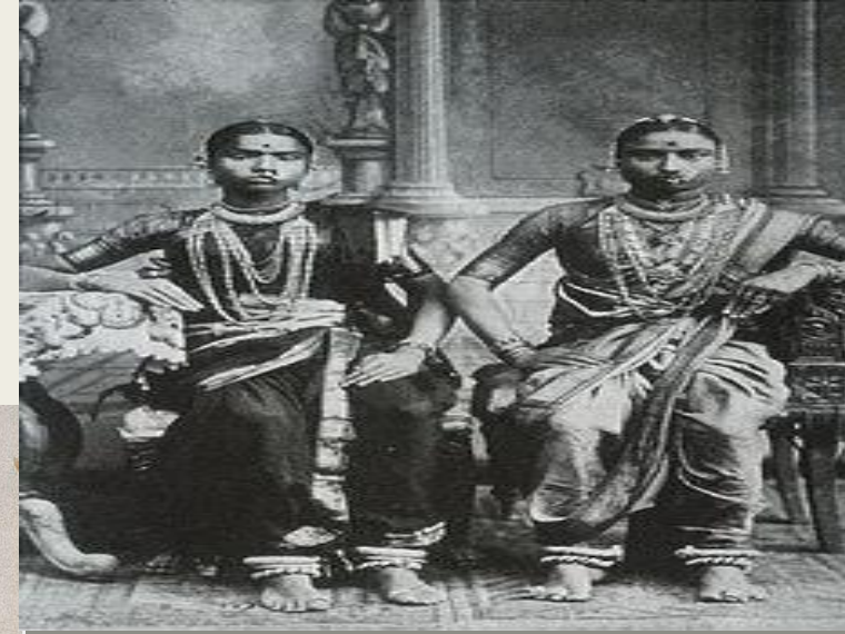
Practice of Devdasi